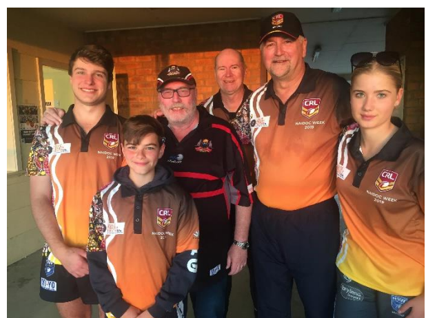
At the End of a Long Day