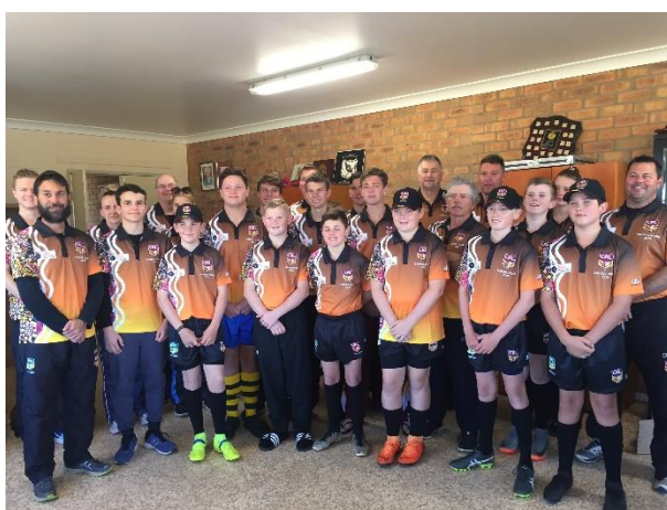
Ready for a Big Day