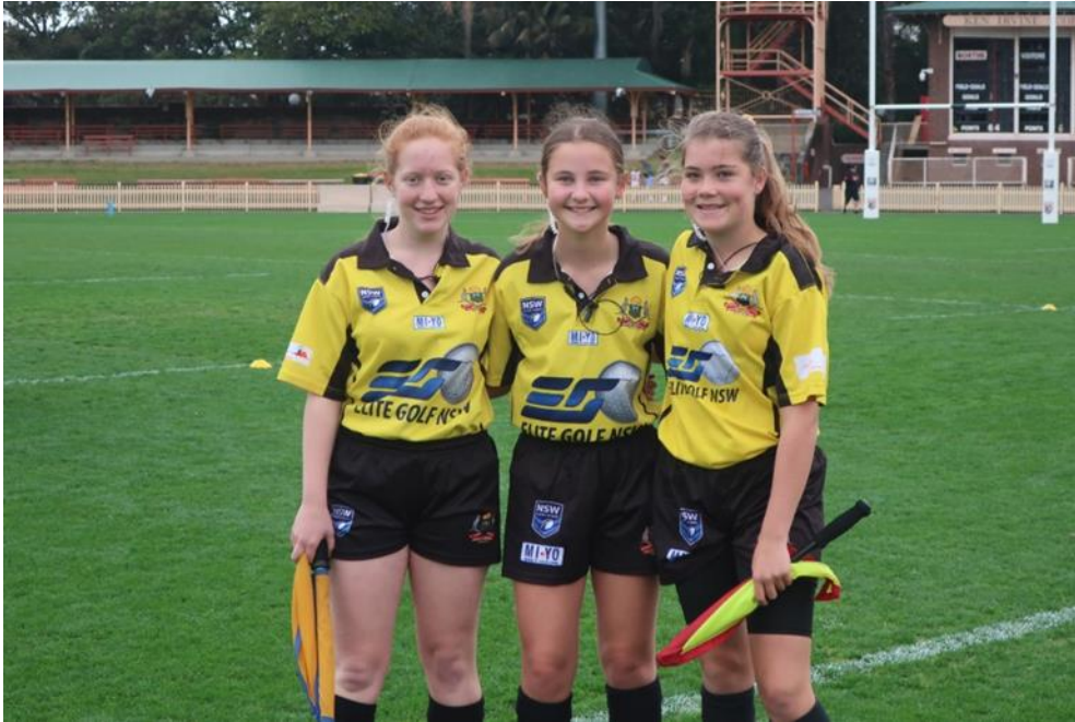
Under 11's League Tag Ku-ring-gai v Leichhardt