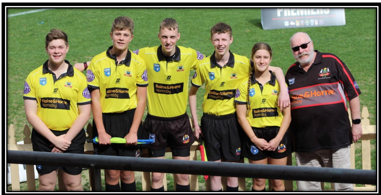
Under 13 Silver: Asquith v Lane Cove