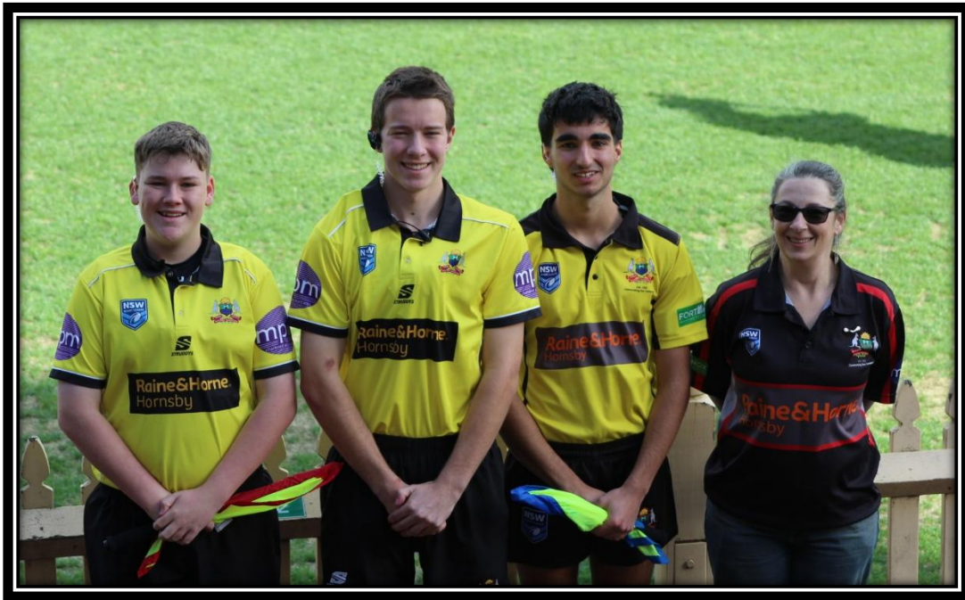
Under 14 Bronze: Asquith v Willoughby